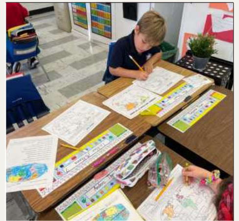
In September, 2nd Graders increased their global knowledge through their mapping of the world.