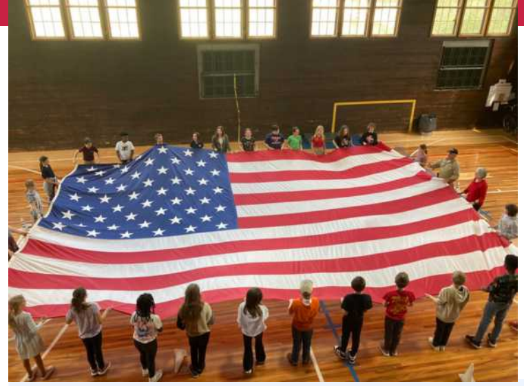
A celebration of our flag with our middle school students

Our sixth grade entrepreneurs raised almost three hundred dollars to donate to the Friends of the Animal Shelter (FOTAS). These enterprising young people sold doggie treats, buttons, bandannas, and an assortment of homemade treats to raise funds.